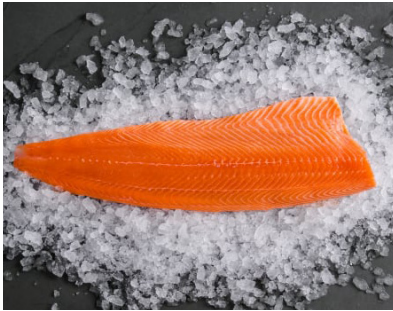
SALMON WHOLE FILLET