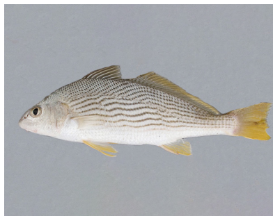
SPOTTED GRUNTER (PARAMAMBA)