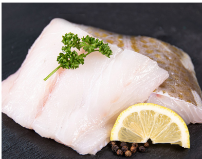
ROCKCOD - PORTION