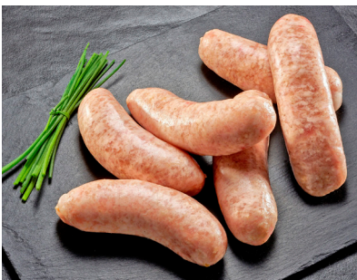
SMOKED CHICKEN SAUSAGE