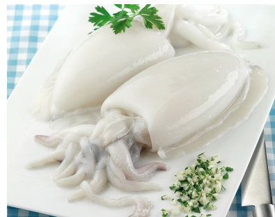
CUTTLE FISH - CLEANED