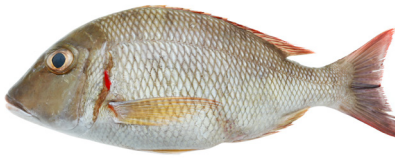
WHITE SNAPPER (CHANGU)