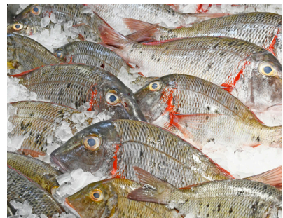
WHITE SNAPPER (CHANGU)