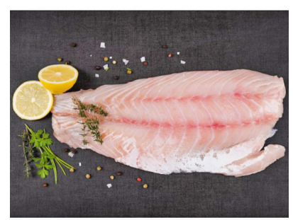
NILE PERCH - IW PACKED