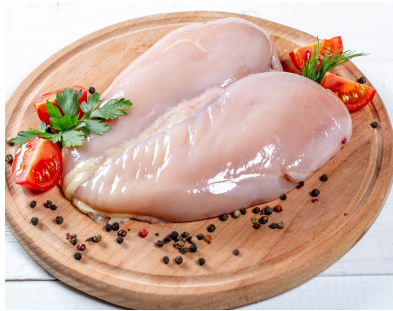
BREASTS - BONE OFF