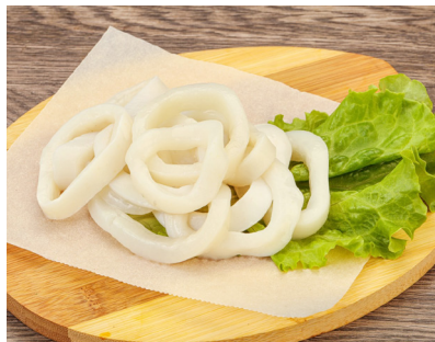
SQUID RINGS - IQF

(Whole & Cleaned) - Packaging : 1 Kg / Pkt