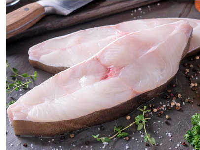
HALIBUT (SOLE FISH)