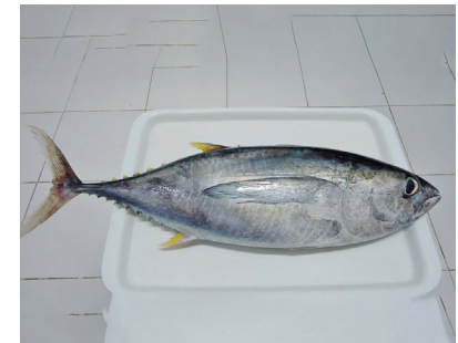
YELLOWFIN TUNA (JODARI)