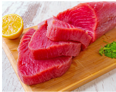
YELLOWFIN TUNA (JODARI)