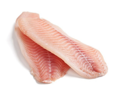
NILE PERCH - VAC PACKED