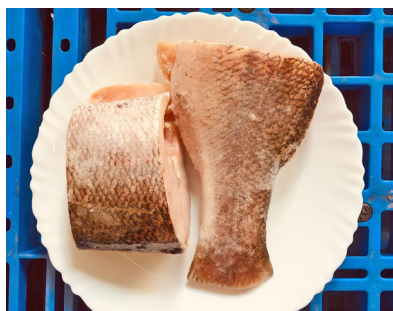
NILE PERCH - CHUNKS