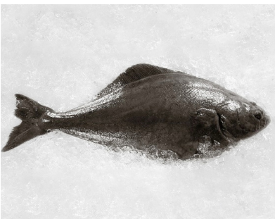
HALIBUT (SOLE FISH)