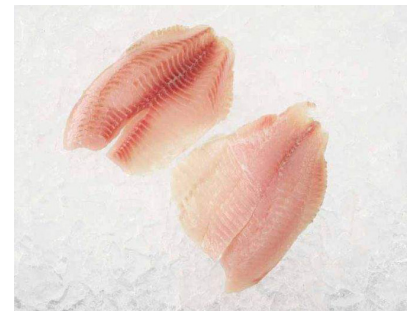
TILAPIA - VAC 3 / 5 OZ