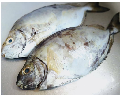
RABBIT FISH (TAFFI)