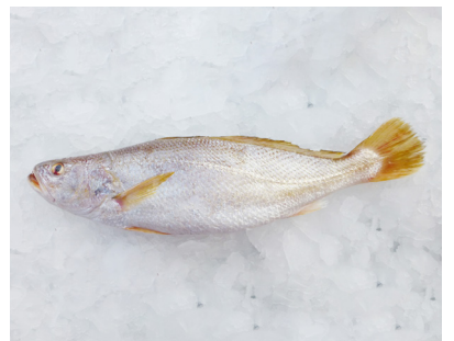
YELLOW CROAKER (KUFADHI)