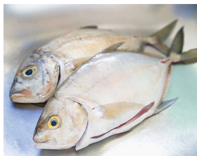
SILVER FISH (KOLEKOLE)