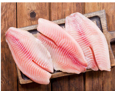
TILAPIA - VAC 7 / 9 OZ