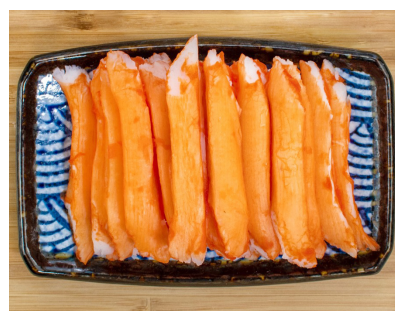
SNOW CRAB FLAVORED LEGS