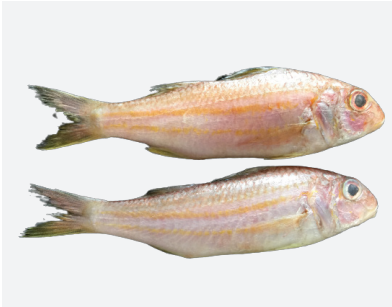
GOAT FISH (SONYO)