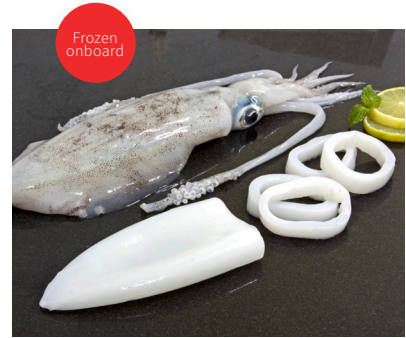
SQUID / CALAMARI

(Whole & Cleaned) - Packaging : 1 Kg / Pkt