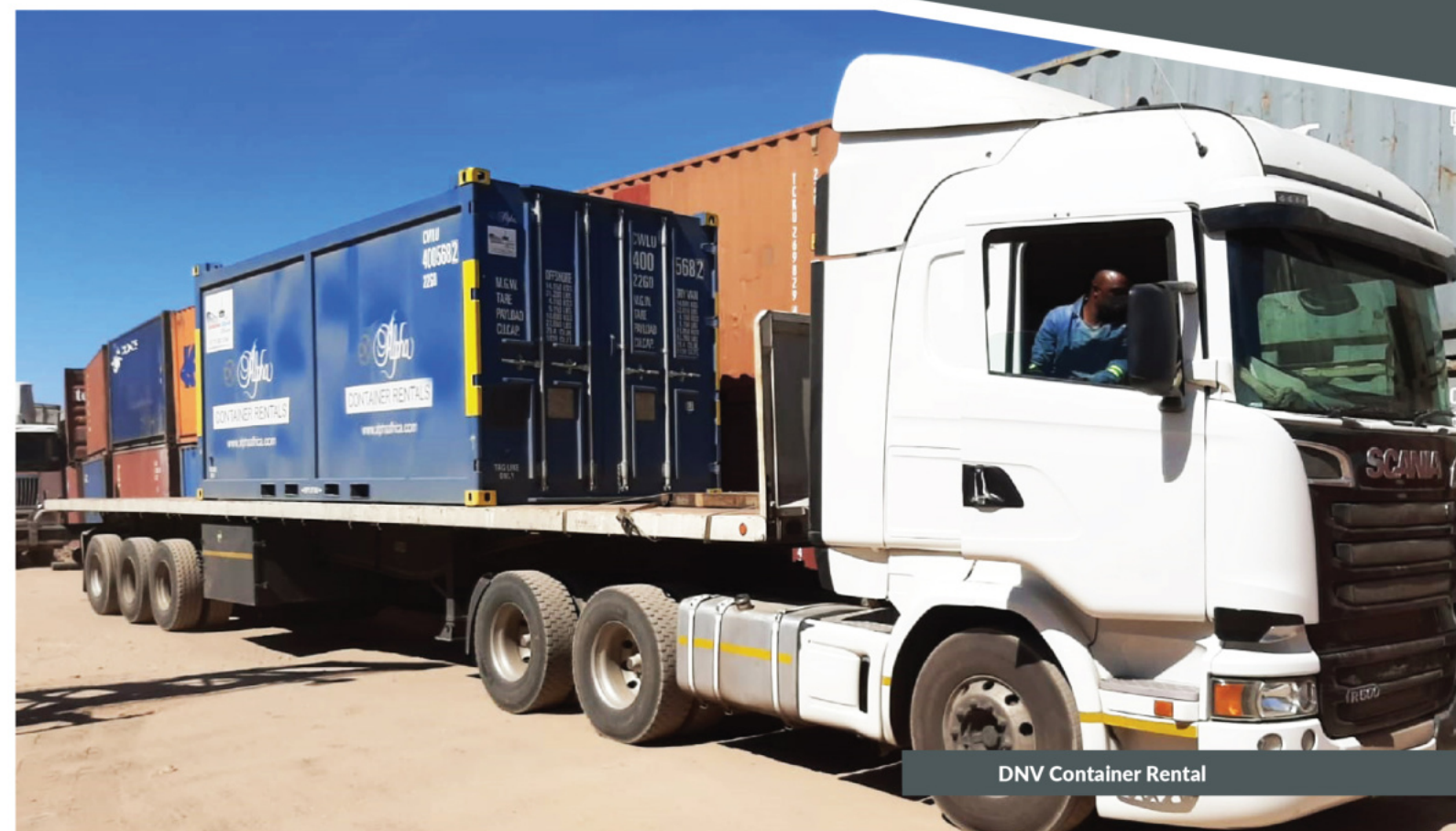
DNV Container Rental