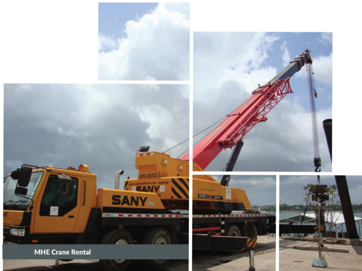
MHE Crane Rental