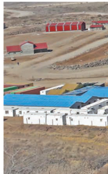
Customized Camp Setup Solutions

Our comprehensive range of piling solutions includes: