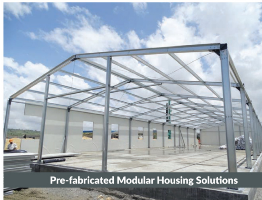
Pre-fabricated Modular Housing Solutions

We have the resources and equipment to meet the needs of any project, on any scale, anywhere.