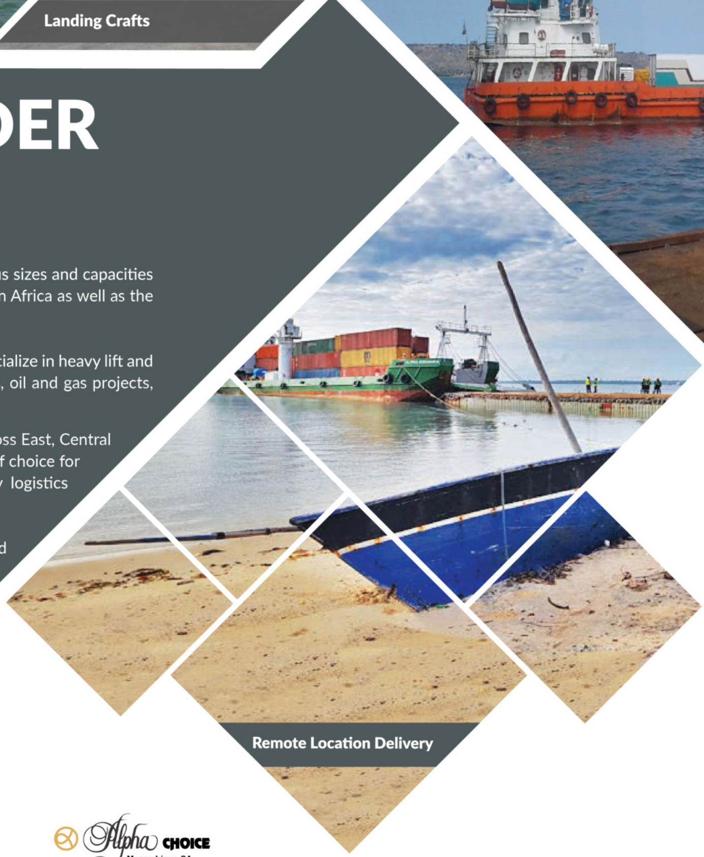
Remote Location Delivery