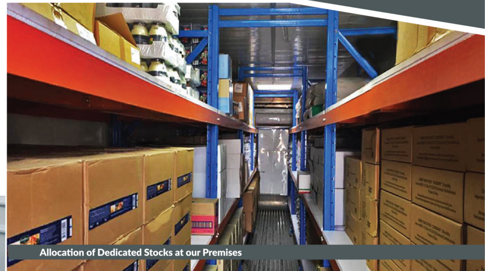
Allocation of Dedicated Stocks at our Premises